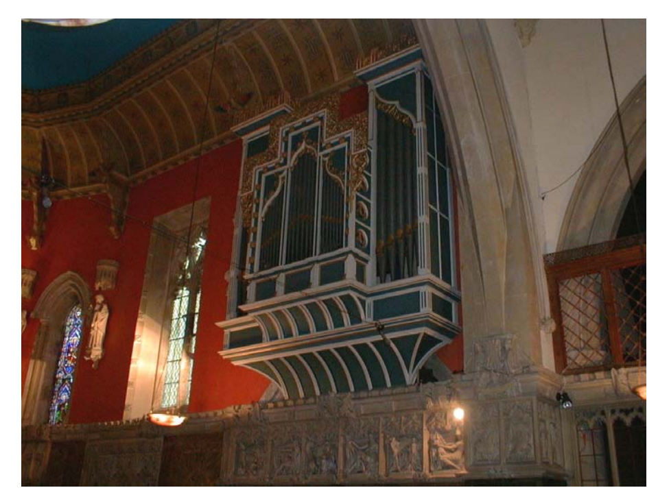
The Scott casing over the south side of the Sanctuary